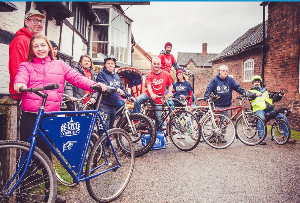
(left) Our trustees