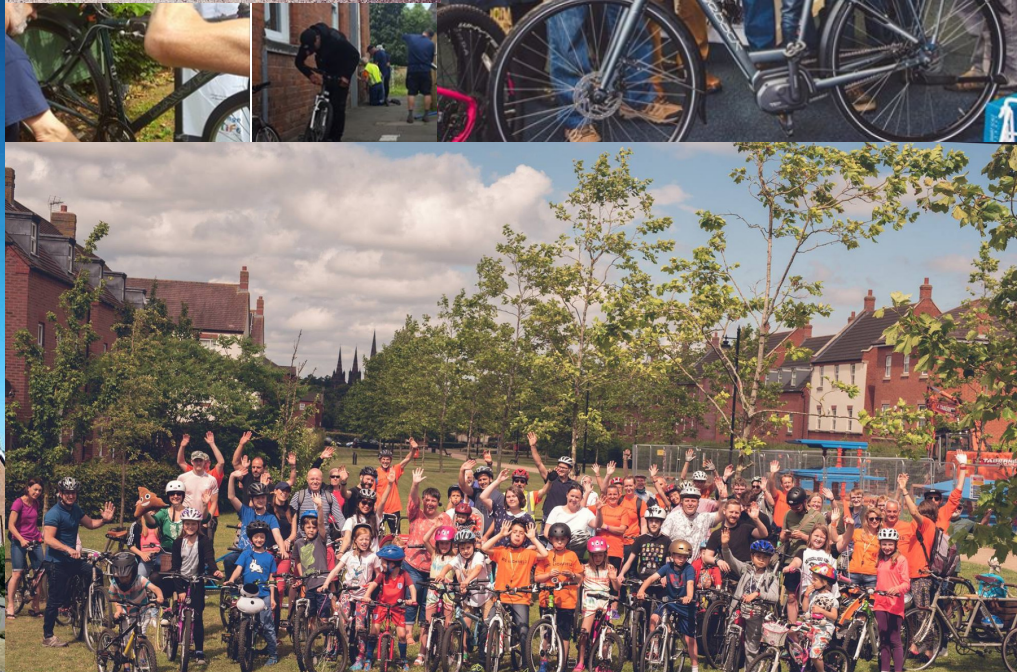
Lichfield Jolly 2017